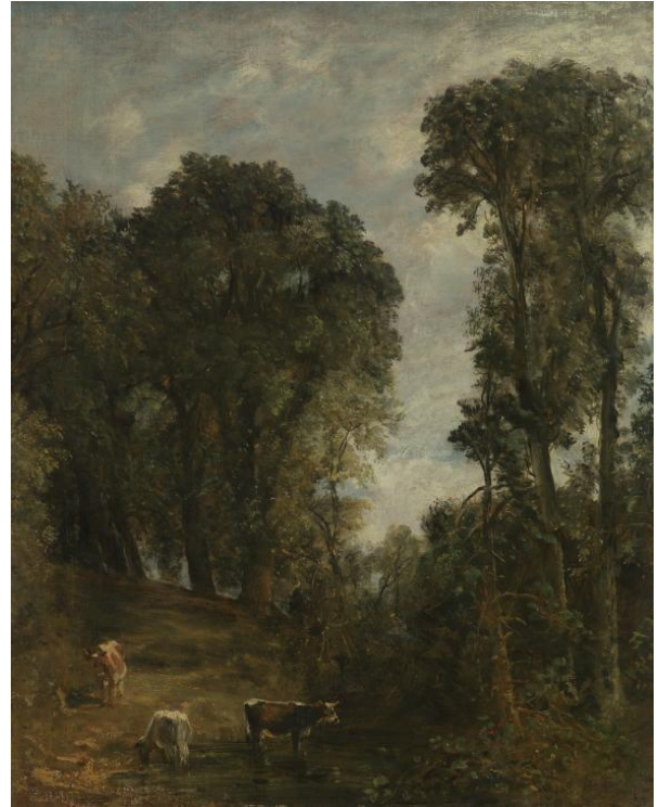
Constable, Trees at Hampstead (1829) 7