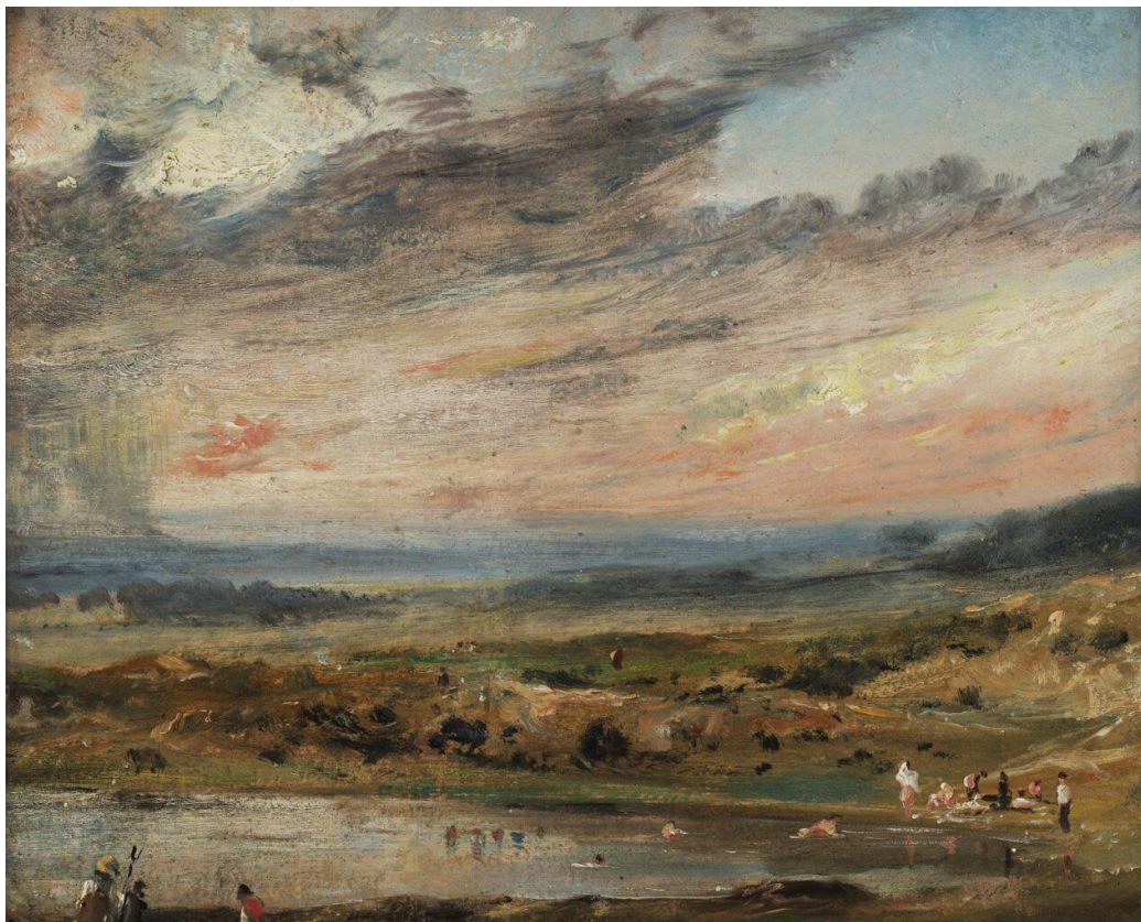
John Constable, Hampstead Heath with Pond and Bathers , 1821. Kenwood House. 8