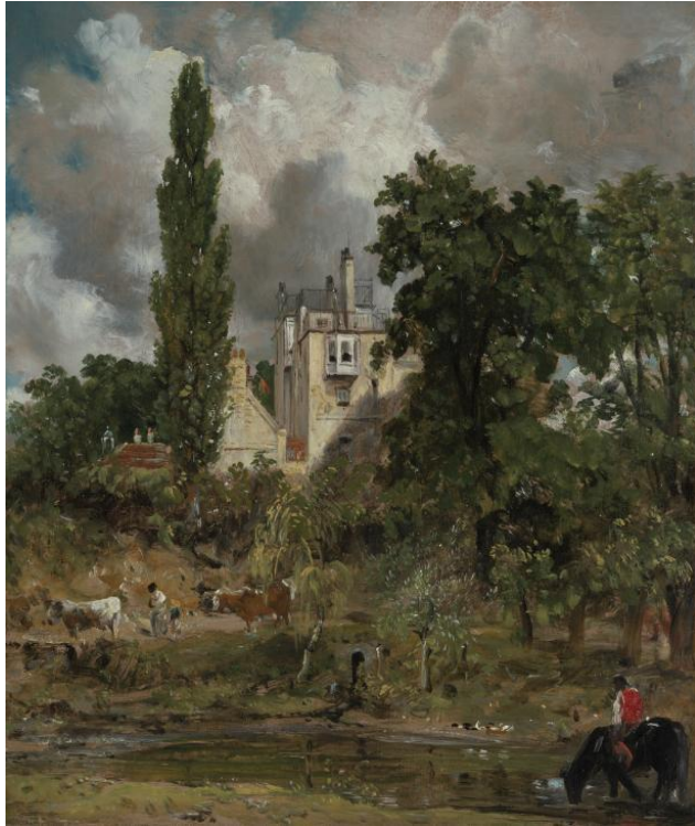
Constable, The Grove, Hampstead (1820-21) 6