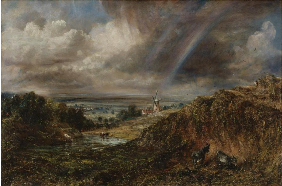
John Constable, Hampstead Heath with a Rainbow , 1836 4