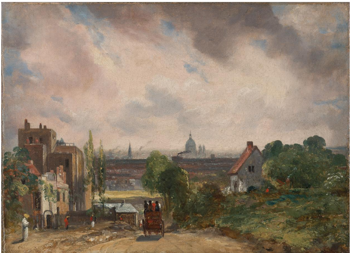
John Constable, Sir Richard Steele's Cottage, Hampstead , (1832) 5