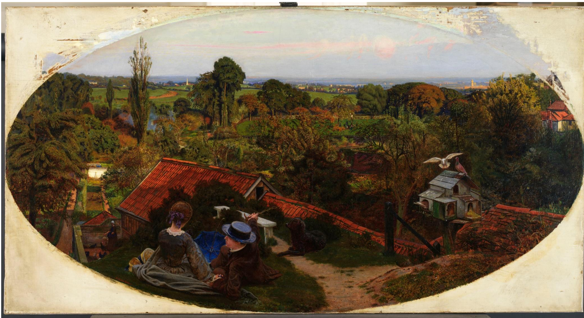
An English Autumn Afternoon , Ford Madox Brown 1852-1853 10