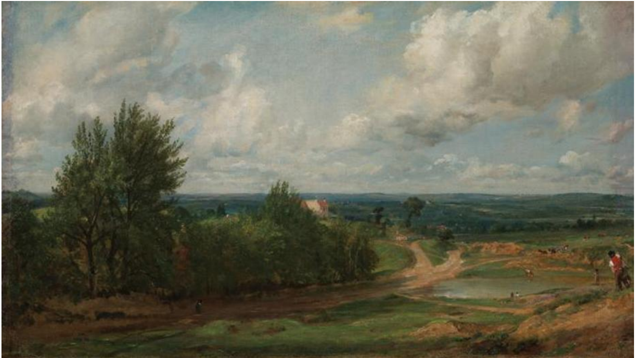
John Constable, Hampstead Heath, with the House Called 'The Salt Box' , c.1819–20 3