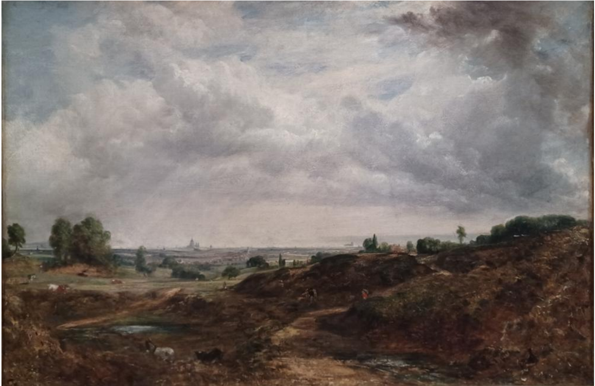
John Constable, Hampstead Heath about 1830 , Kelvingrove Museum, Glasgow.